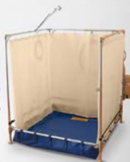
SS4040 Super Standard