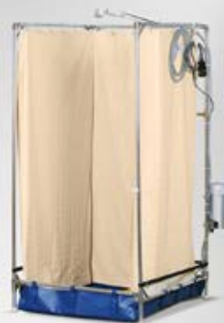
T4000 Tall Series